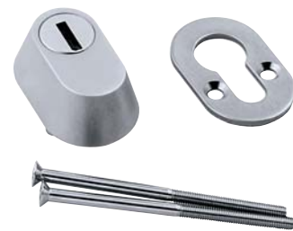
Oval (21 mm distance between screw holes centers)

Choose the thickness "X" according to the cylinder protrusion "S":