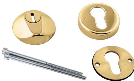
Round (38 mm distance between)

NB. Tenax can be used with all the AGB SCUDO cylinders.